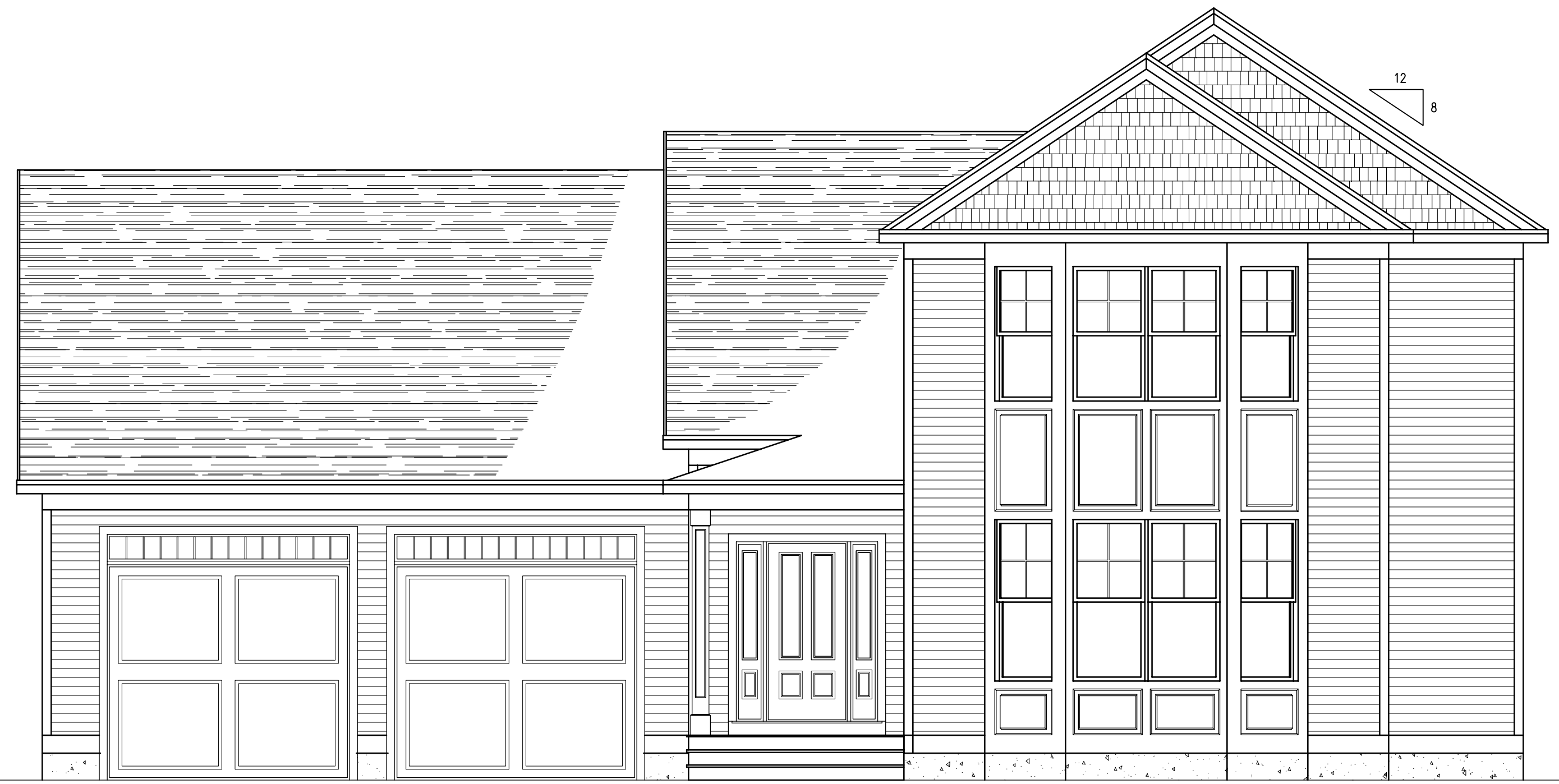
FRONT ELEVATION 1/4" = 1'-0"

CONSTRUCTION NOTE: CONTRACTOR TO VERIFY GRADE AND ALL DIMENSIONS IN FIELD BEFORE CONSTRUCTION. DESIGN SHOWN MAY DIFFER FROM ACTUAL FINISHED CONSTRUCTION. FINAL MATERIALS, WINDOW/DOOR LOCATIONS AND SIZES, TO BE DETERMINED PER OWNER/CONT. OR LOCAL CODES.