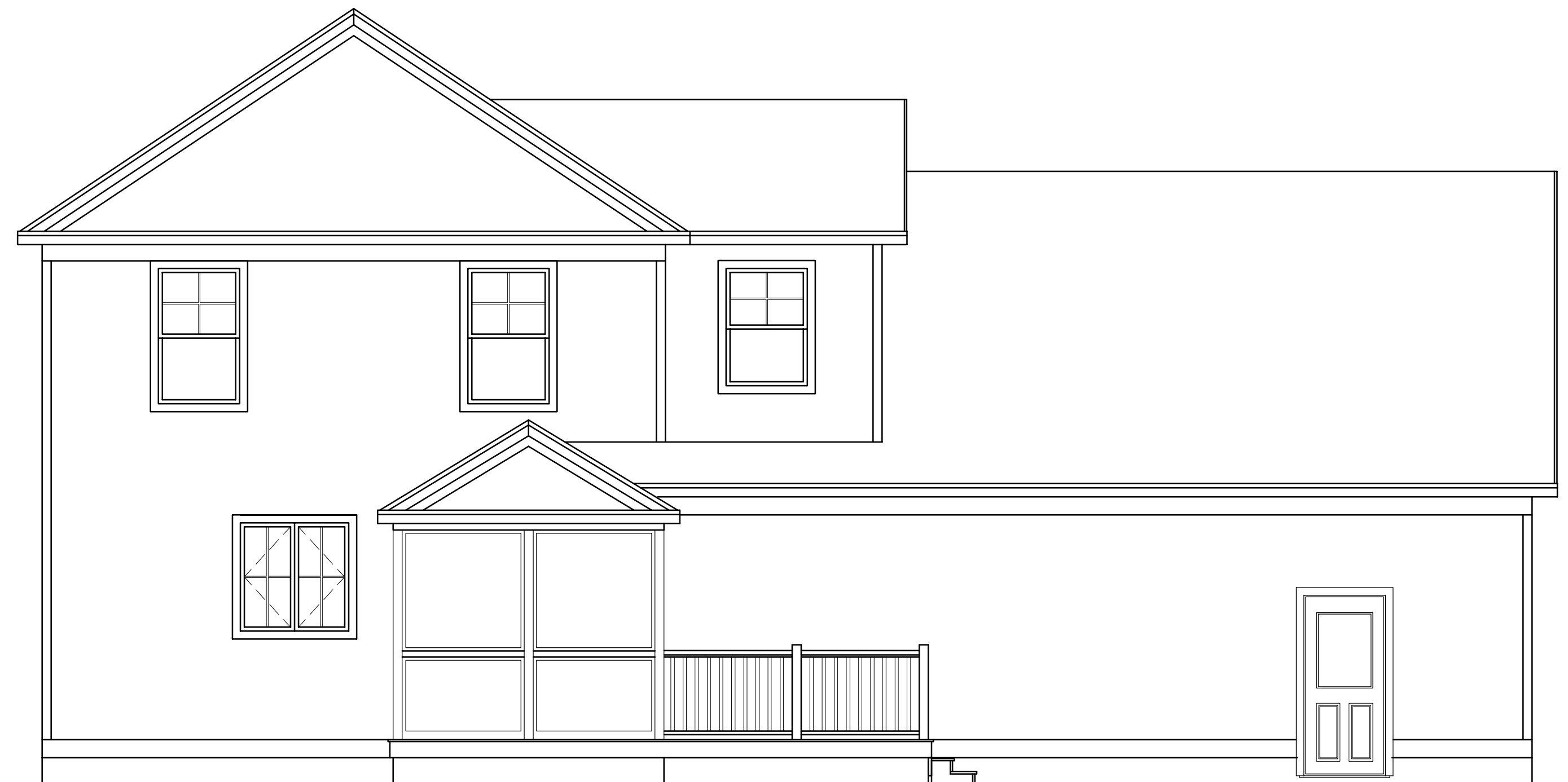
REAR ELEVATION 1/4" = 1'-0"

CONSTRUCTION NOTE: CONTRACTOR TO VERIFY GRADE AND ALL DIMENSIONS IN FIELD BEFORE CONSTRUCTION. DESIGN SHOWN MAY DIFFER FROM ACTUAL FINISHED CONSTRUCTION. FINAL MATERIALS, WINDOW/DOOR LOCATIONS AND SIZES, TO BE DETERMINED PER OWNER/CONT. OR LOCAL CODES.