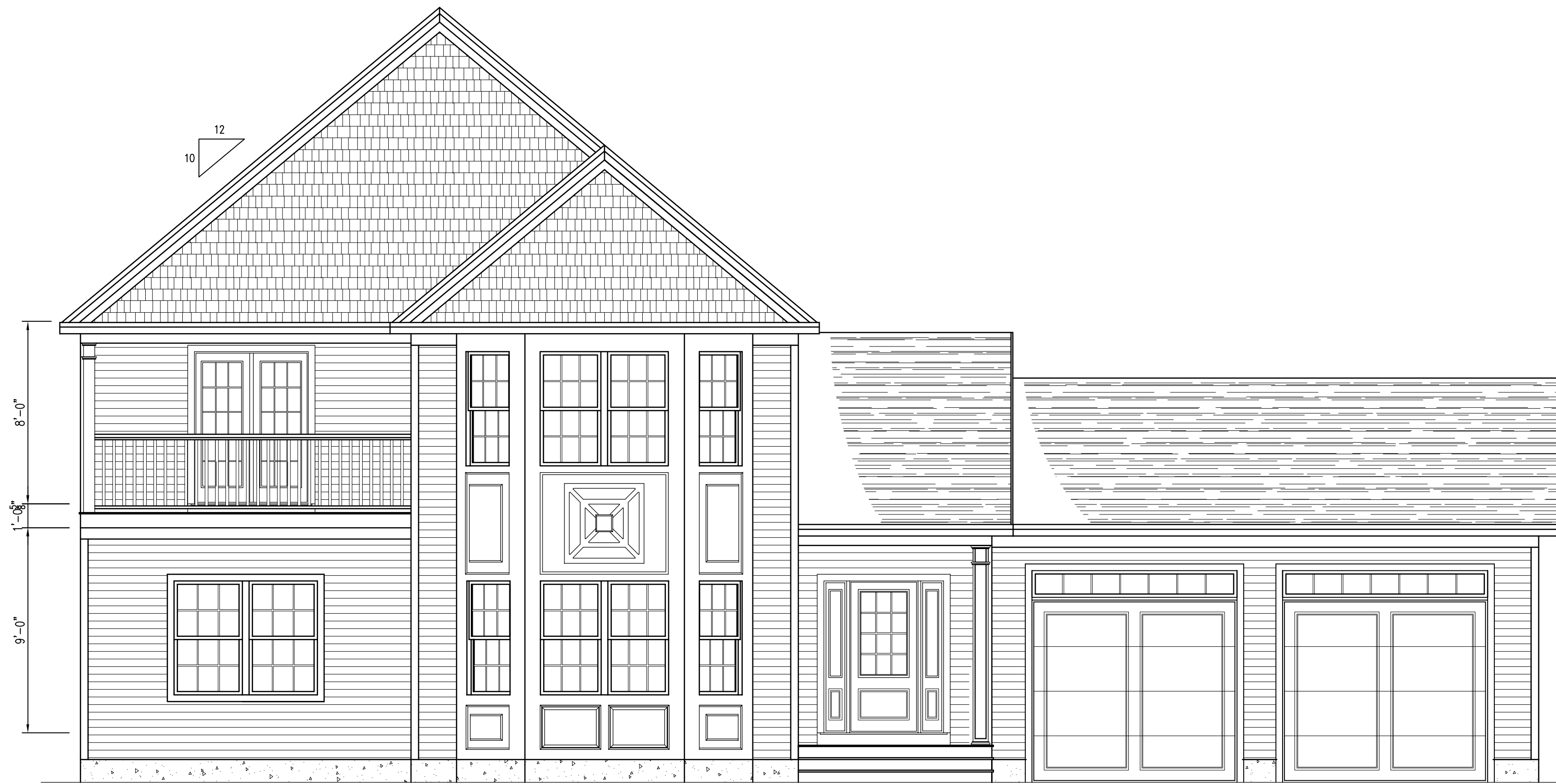
FRONT ELEVATION; 2357sqft 1/4" = 1'-0"

CONSTRUCTION NOTE: CONTRACTOR TO VERIFY GRADE AND ALL DIMENSIONS IN FIELD BEFORE CONSTRUCTION. DESIGN SHOWN MAY DIFFER FROM ACTUAL FINISHED CONSTRUCTION. FINAL MATERIALS, WINDOW/DOOR LOCATIONS AND SIZES, TO BE DETERMINED PER OWNER/CONT. OR LOCAL CODES.