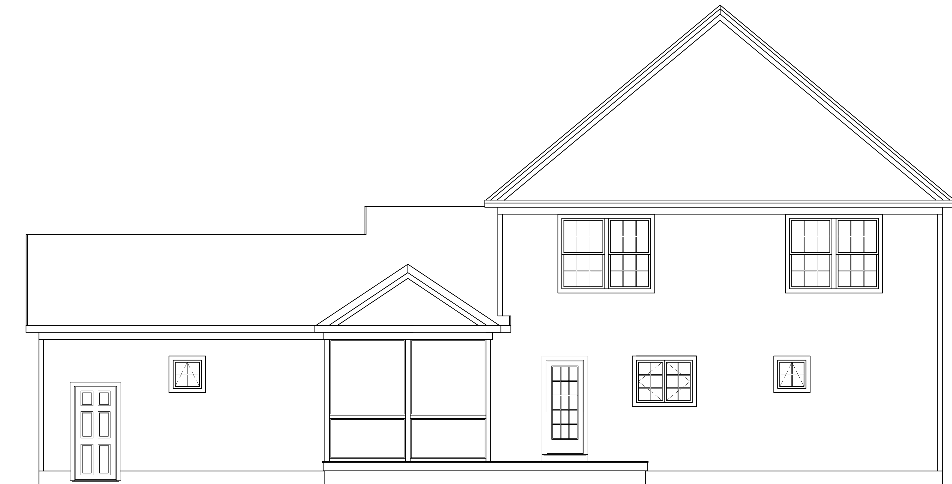
REAR ELEVATION 1/4" = 1'-0"

CONSTRUCTION NOTE: CONTRACTOR TO VERIFY GRADE AND ALL DIMENSIONS IN FIELD BEFORE CONSTRUCTION. DESIGN SHOWN MAY DIFFER FROM ACTUAL FINISHED CONSTRUCTION. FINAL MATERIALS, WINDOW/DOOR LOCATIONS AND SIZES, TO BE DETERMINED PER OWNER/CONT. OR LOCAL CODES.